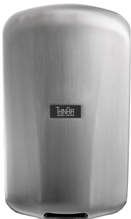
TA-SB Brushed Stainless Steel

MODELS: TA - ABS SB -VOLTAGE (See Chart)