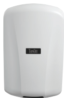
TA-ABS White Polymer (ABS)