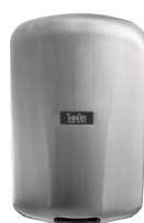
TA-SB Brushed Stainless Steel